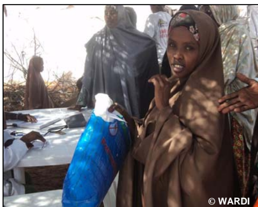
Distribution of bed nets to women in Mogadishu